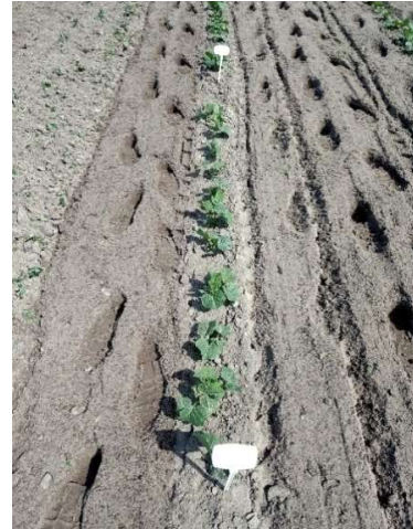
Experiment II: Cucumber plants cv. Octopus, field experiment, the Experimental Orchard IO-PIB in Skierniewice.