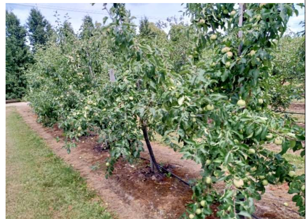
Experiment III: Gold Milenium of apple trees grafted on M9 rootstock, located at the Experimental Orchard IO-PIB in Dąbrowice.